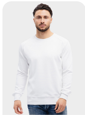
LEM4732 Everywear Cooldry Crewneck Sweater 48% cotton (outside) - 47% polyester (inside) - 5% elastane