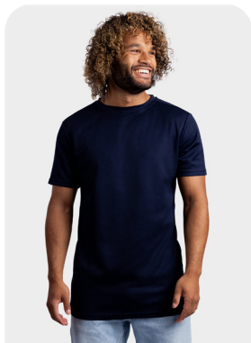
LEM4504 Everywear Cooldry T-shirt 50% cotton (inside) - 50% polyester (outside)