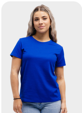
LEM4502 Everywear Cooldry T-shirt 50% cotton (inside) - 50% polyester (outside)