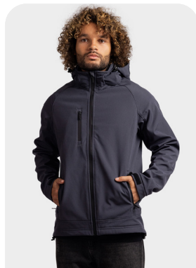
LEM4829 Everywear Softshell Hooded Jacket 96% polyester - 4% spandex - softshell