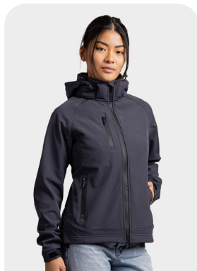
LEM4827 Everywear Softshell Hooded Jacket 96% polyester - 4% spandex - softshell