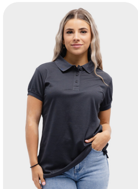
LEM4602 Everywear Cooldry Polo 50% cotton (inside) - 50% polyester (outside)