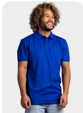
LEM4604 Everywear Cooldry Polo 50% cotton (inside) - 50% polyester (outside)