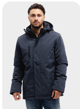
LEM4855 Everywear Winter Softshell Hooded Jacket | 96% polyester - 4% spandex - softshell | padding & lining: 100% polyester