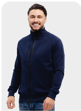
LEM4762 Everywear Cooldry Cardigan 48% cotton (outside) - 47% polyester (inside) - 5% elastane