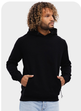
LEM4772 Everywear Cooldry Hooded Sweater 48% cotton (outside) - 47% polyester (inside) - 5% elastane